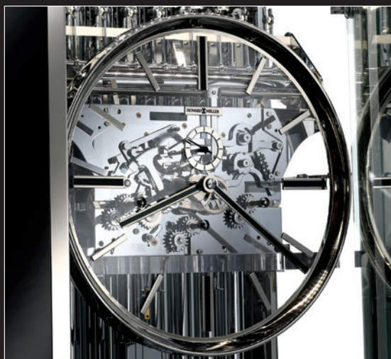
611-230 PARK AVENUE LIMITED EDITION