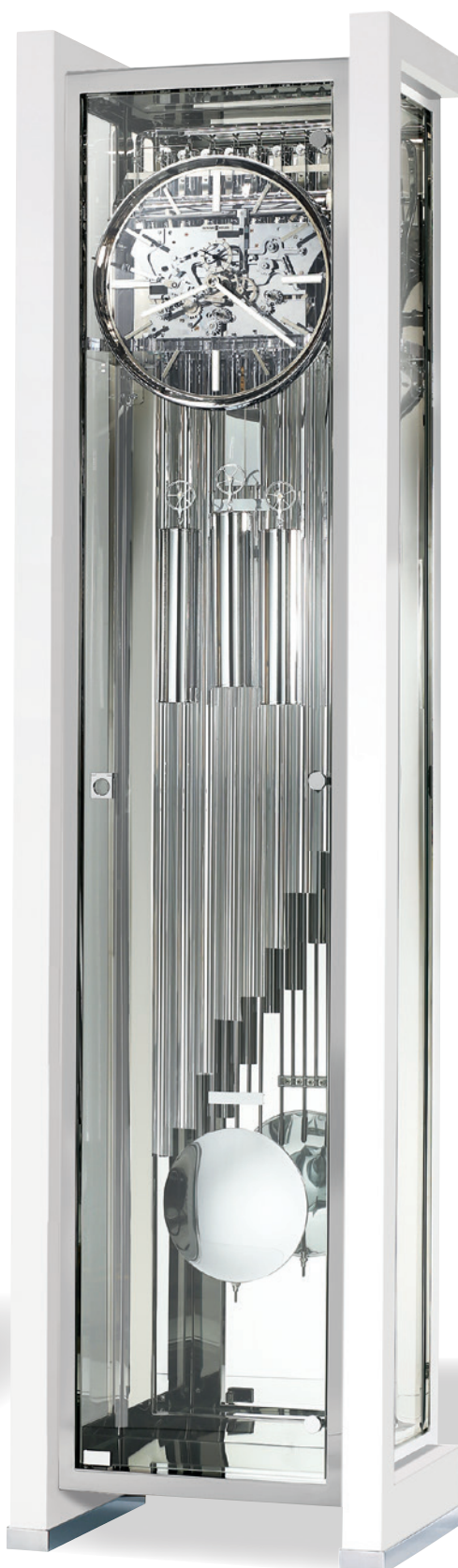
611-231 PARK AVENUE II LIMITED EDITION