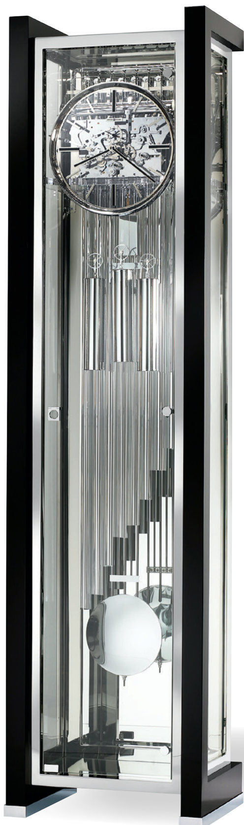
611-230 PARK AVENUE LIMITED EDITION

These exquisite floor clocks are a feast for the senses. No other clock in the world looks, feels, or sounds like the Park Avenue Limited Edition clocks.