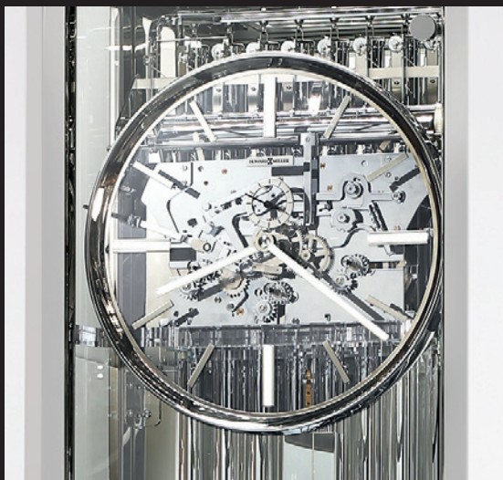
611-231 PARK AVENUE II LIMITED EDITION

1/4" thick clear, see-through, acrylic dial features polished stainless steel chrome markers and hands with insets, and a polished chrome finished bezel.